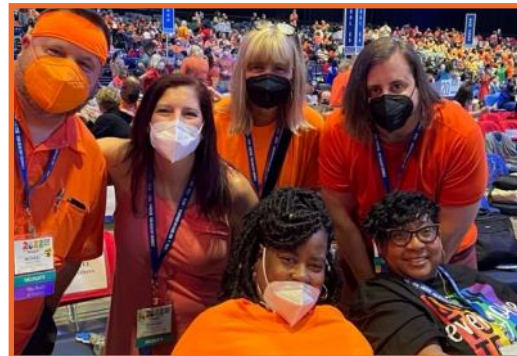
"Orange Day" at the NEA RA — and our members turned out in style! This year the RA was both in-person and virtual. More photos on page 4.