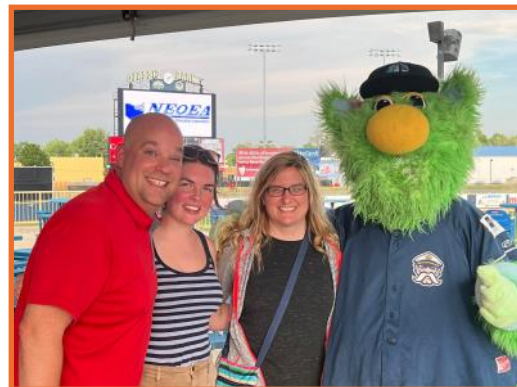
Our Summer Leadership Conference's Wednesday evening event was at the Lake County Captains. We had time to relax, socialize, meet new friends, and catch up with old ones. We also had a chance to meet their mascot, Skipper.